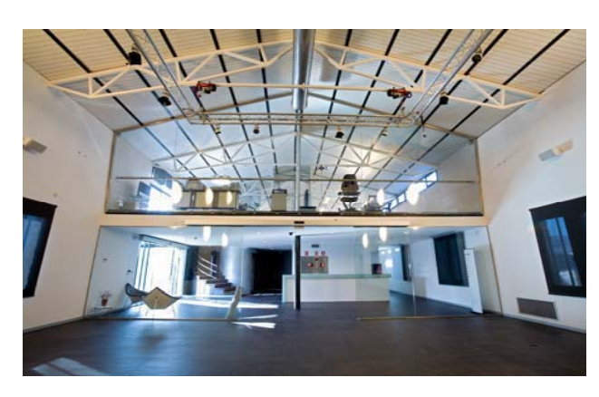
Headquarters - Madrid

This thirst of control push us to be the reference in development of projects integration in control room, Datacenter and technological environments.