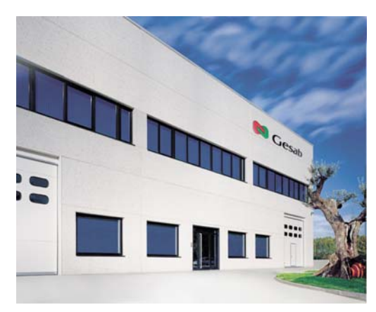
Manufacture - Barcelona